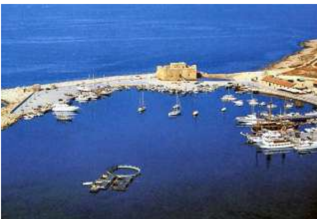
Kato Paphos Harbour, Cyprus

The 2010 Paphiakos Hot Dog Show will be held on the picturesque harbour of Paphos. There is ample, easy parking for everyone at the harbour's own car park. Being one of the busiest tourist and local spots in the area, this makes it an ideal opportunity for potential business. Last year the Paphiakos Hot Dog Show was attended by over 15,000 people. As a family day out it makes it the largest event of its kind to be held annually in Paphos